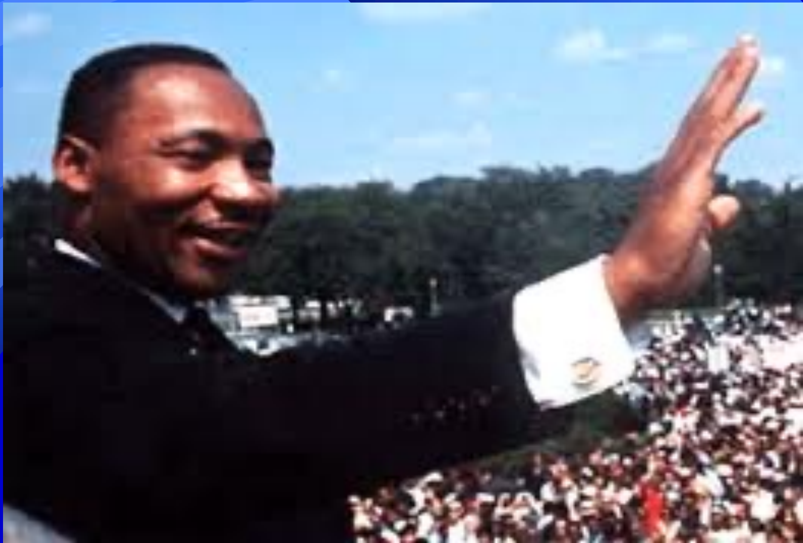
Dr. Martin Luther King