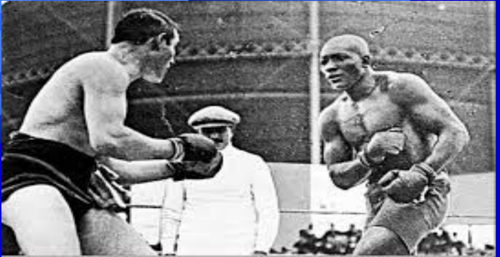
Jack Johnson 1871 - 1946