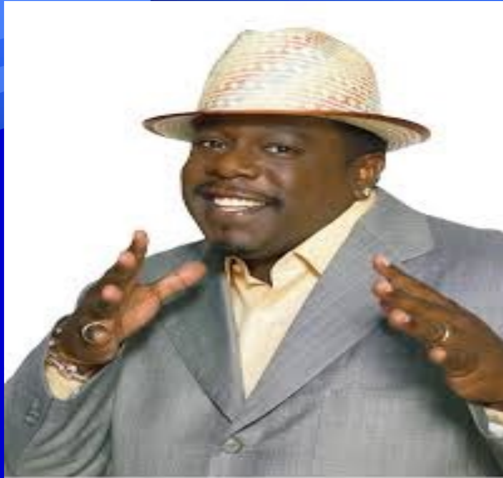
Cedric the Entertainer